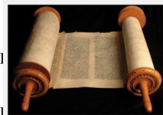
The Masoretic Text is significantly different from the original Hebrew Scriptures.

used to believe the Masoretic Text was a perfect copy of the original Old Testament. I used to believe that the Masoretic Text was how God divinely preserved the Hebrew Scriptures throughout the ages. was wrong.